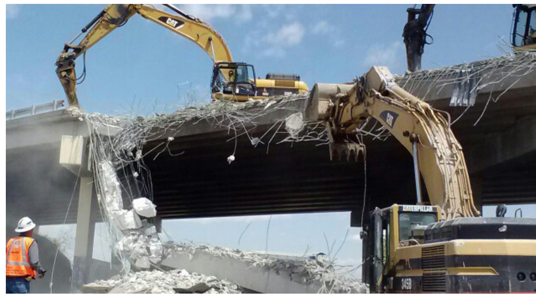
Burlington Northern Santa Fe (BNSF) bridge demolition